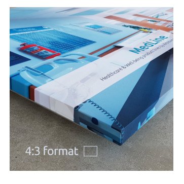
FR | Custom Print (UN)